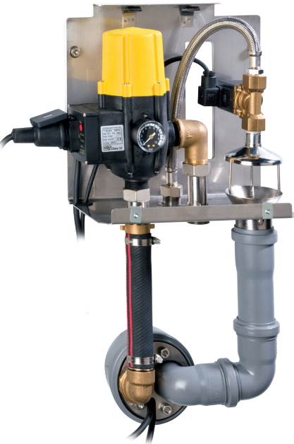
Dimensions of the Multimat wall bracket (in mm): W 310 x H 310 x D 150