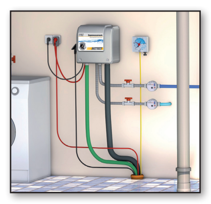
The wall bracket with the controller for the pump and mains water topup is installed indoors. Additional accessory: Level indicator